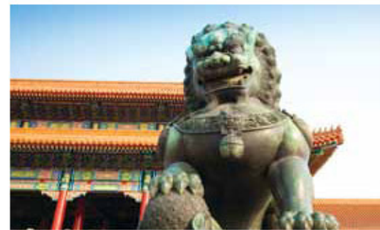
Guardian Lion Statue in the Forbidden City, Beijing

11 days, 8 nights | Beijing, Xian, Suzhou, Shanghai