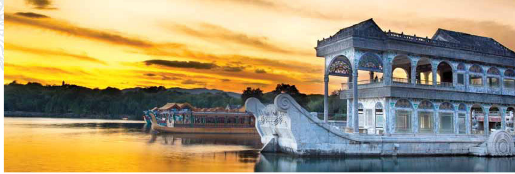
Marble boat Summer Palace Beijing