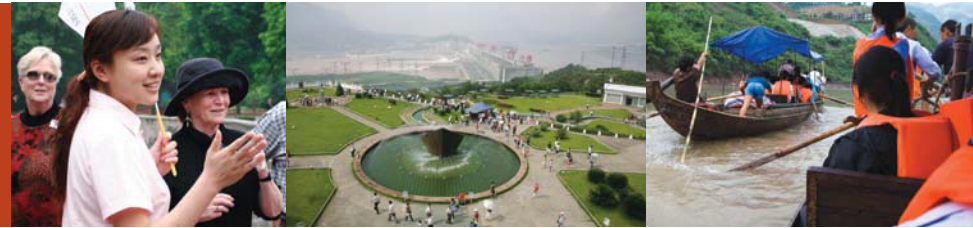
The Biggest Hydroelectric Power Station in China, Three Gorges Dam

Featuring a luxurious 5-Star Century Diamond Cruiser down the magnificent Yangtze River and a spectacular journey to famous modern and ancient architectural wonders, this China excursion will lead you on an unforgettable adventure. Experience ancient rural China and the massive Three Gorges Dam Project on exciting shore excursions along the Yangtze River. Enjoy the ancient Terracotta Warriors in Xian, the massive Great Wall of China, a delicious peking duck banquet in Beijing, and the brilliant Pearl TV Tower in Shanghai. The Yangtze Downstream Discovery provides a memorable taste of China to cherish your entire life.