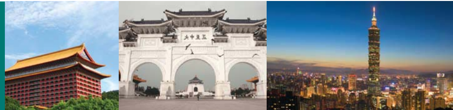
CKS Memorial Park

Our Taiwan Discovery Tour combines three truly unique and major cities. First the dynamic capital city of Beijing provides insights on the historical, political and social aspects of China. Next Shanghai, the "Pearl of the Orient" will astound you with its architecture, fashion sense and ability to blend the old and new of China. To complete this wonderful tour you visit Taipei – a city that combines East and West cultures with a profound focus on enterprise and the future. Your visit to these cities will provide an understanding of their influence on Asia, and, indeed the world.