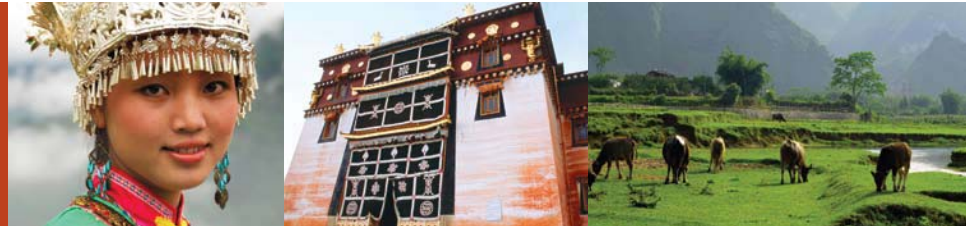
Songzanlin Tibetan Monastery near Zhongdian, China

The Shangrila Discovery is your opportunity for a breathtaking, picturesque adventure through China's Yunnan Province. Depart on a sparkling Li River Cruise and venture to the Kunming Stone Forest with immense, colorful limestone structures. View China from atop the sacred Jade Dragon Mountain near Lijiang and experience the mighty Yangtze River passing through the fantastic Tiger Leaping Gorge. Afterwards, visit the bustling economy of Shanghai, home of the 2010 World Expo. You will be inspired by "The Land of Sacredness and Peace" throughout your Shangrila Discovery.