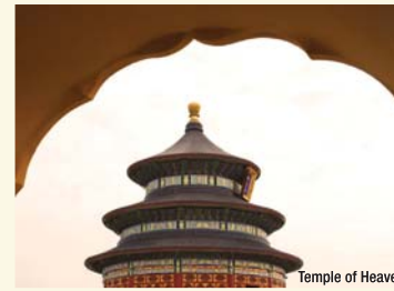
Temple of Heaven

Tour Price Includes: International & Domestic China Airfare, Meals, Tours, Guides and Hotels