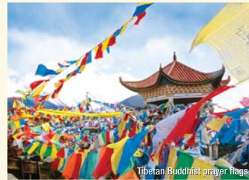
Tibetan Buddhist prayer flags