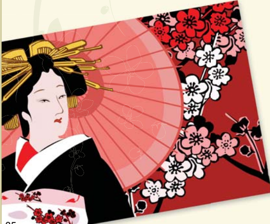
35 Japanese Artwork