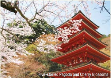
Five-story Pagoda and Cherry Blossoms