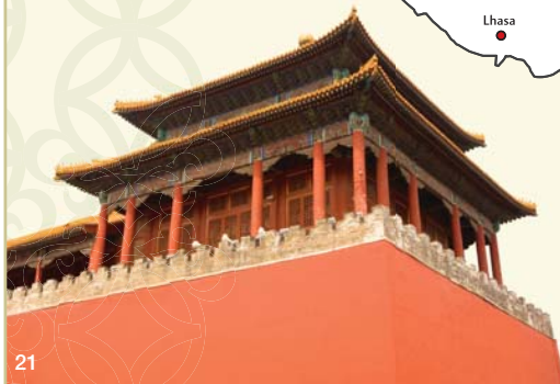
Forbidden City in Beijing