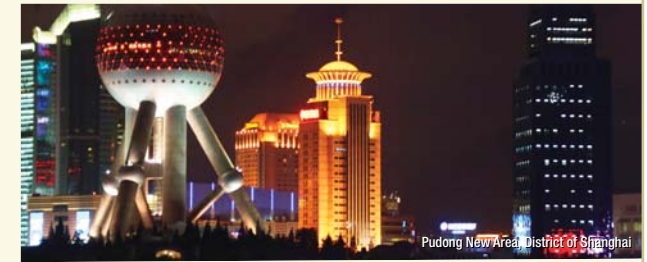
Pudong New Area, District of Shanghai